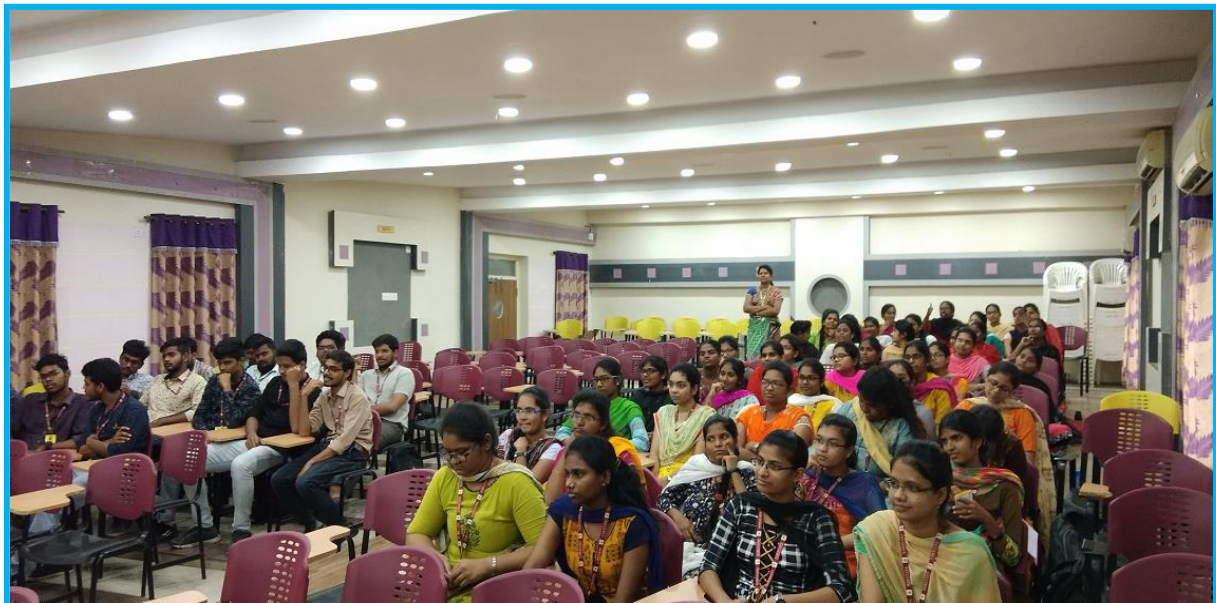
Fig: III B.Tech ECE Students are actively participating in JAM